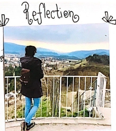
Maribor, 6 th March 2022