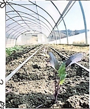
Jarenina, 25 th March 2022

Apple trees Straw-black- rasp berries Soliper force