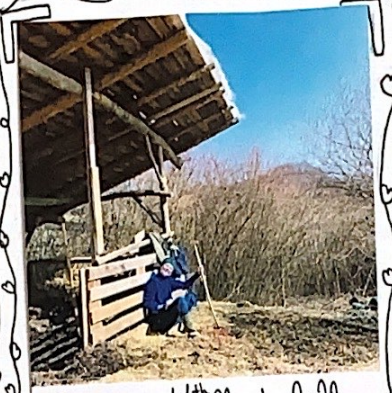
Jarenina, 11 th March 2022

Perfectionism Overthinking Time losing Feeling down It's an experience that can really help you to get to know your limits and discover without the judgement you could find in a workplace. This is the reason why you choose to be a volunteer.