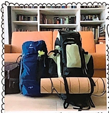
Muggia, 28 th February '22

Perfectionism Overthinking Time losing Feeling down It's an experience that can really help you to get to know your limits and discover without the judgement you could find in a workplace. This is the reason why you choose to be a volunteer.