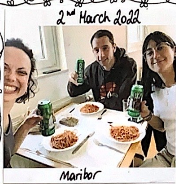
2 nd March 2022